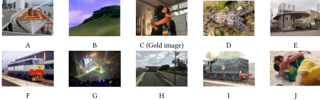
Figure 1: Candidate images for the phrase t "tender embrace".

Q: What is the most appropriate caption for the tender embrace? Answer Choices: (A) a small boat sitting on top of a dock. (B) a group of people walking on a green hill. (C) a student gets a hug from a student. (D) a large fly laying on a rock in the water. (E) the bus stop at the station (F) a train is parked at a station. (G) a crowd of people watching a concert. (H) a train station with a sign on the side of it. (I) a black and red train on a track. (J) a man laying in the sand on top of a surfboard.