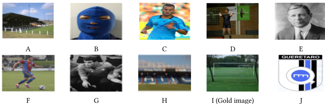
Figure 3: Candidate images for the phrase t "football goal".

We are going to present some qualitative results regarding few-shot prompting. Fig. 3 contains candidates corresponding to the phrase "football goal", while GiT-L (greedy) serves as the captioner. The k=5 in-context samples are demonstrated in Tab. 7 followed by the answer A generated by GPT-3.5-turbo (in color) corresponding to the given Q . In the presented case, in-context prompting achieves in guiding GPT-3.5-turbo to select the correct candidate I.